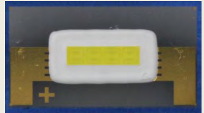
Head light white LED

This 35 page report reveals the white LED structure, including X-ray, SEM cross-section, EDX composite analysis.