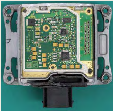
Top view of main PCB

March 15, 2016. LTEC Corporation released its technical analysis report of a 77GHz radar module developed by Bosch GmbH.