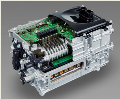
Prius ZVW51 front inverter

June, 2016. This ninety-five page document is one of six reports, each analyzing various segments of the ZVW51 system. This report is focusing on the control board and its detailed circuits analysis. PCB structural details with various dimensions, component list, block diagram, detailed circuit schematic diagram, transformer inductance measurement, noise countermeasures and thermal analysis results are included in this report.