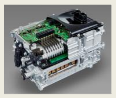
Prius ZVW51 front inverter unit

March 2017. LTEC corporation released ASIC function estimation analysis reports of Toyota Prius ZVW51 motor inverter main control board. There are three AISCs on the board. MCU by Renesas (n=1), ASIC by Denso (n=1) and a Gate driver ASIC by Denso (n=14) that drives the power devices.