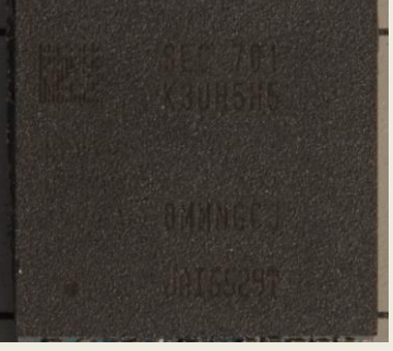
Package top view Exynos8895