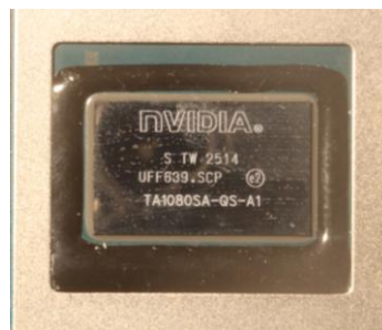
SoC: nVIDIA Thor